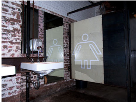
[ http://2.bp.blogspot.com/_Wv1yKeKLlc8/TS4WnHaNpGI/AAAAAAAAABBs/eLNaDvrQodE/s1600/Public_Art_BCA_2010_Women_1%2BKomfeld.jpg ]