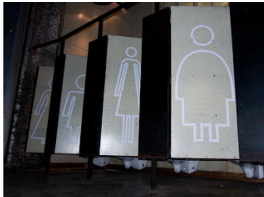
[ http://3.bp.blogspot.com/_Wv1yKeKLlc8/TS4WndOdojI/AAAAAAAAABB8/nfg_bc_nAVg/s1600/Public_Art_BCA_2010_Women_3%2BKomfeld.jpg ]