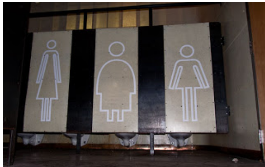
[ http://4.bp.blogspot.com/_Wv1yKeKLlc8/TS4WnSC-FcI/AAAAAAAAABB0/WrxmaU6p0IQ/s1600/Public_Art_BCA_2010_Women_2%2BKomfeld.jpg ]