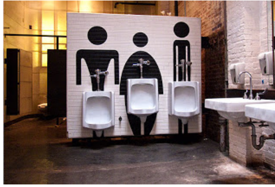
[ http://4.bp.blogspot.com/_Wv1yKeKLlc8/TS4WmikVeXI/AAAAAAAAABBk/Te49-FuQ0IQ/s1600/Public_Art_BCA_2010_Men_2%2BKomfeld.jpg ]